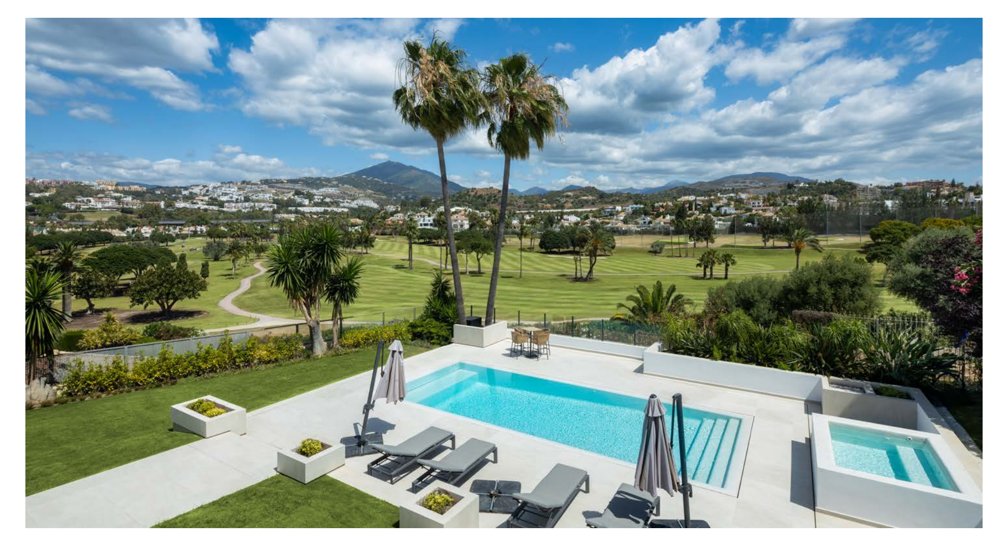
Tucan 12 enjoys a coveted location within a gated community in Nueva Andalucia. Sitting on a frontline golf plot, residents of Tucan 12 enjoy convenient access to world-renowned golf courses, as well as 5-star amenities and the famous Puerto Banús.